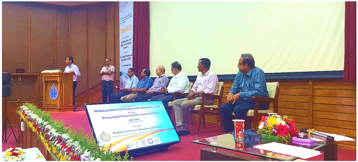
Valedictory Meeting on 15/11/2022