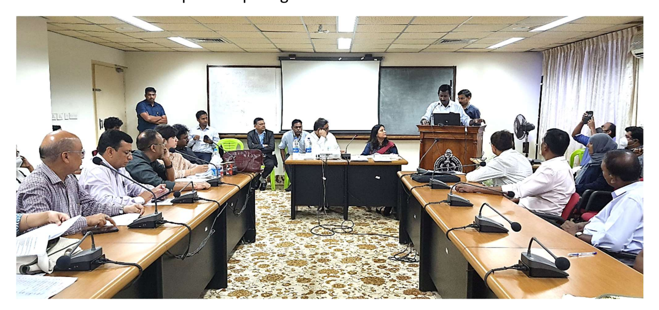
Mock Institutional Animal Ethics Committee Meeting on 15/11/2022