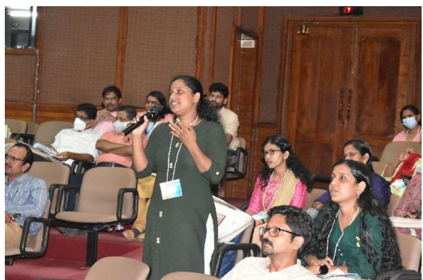
Workshop on Preparing B- Forms and the conduct of IAEC"